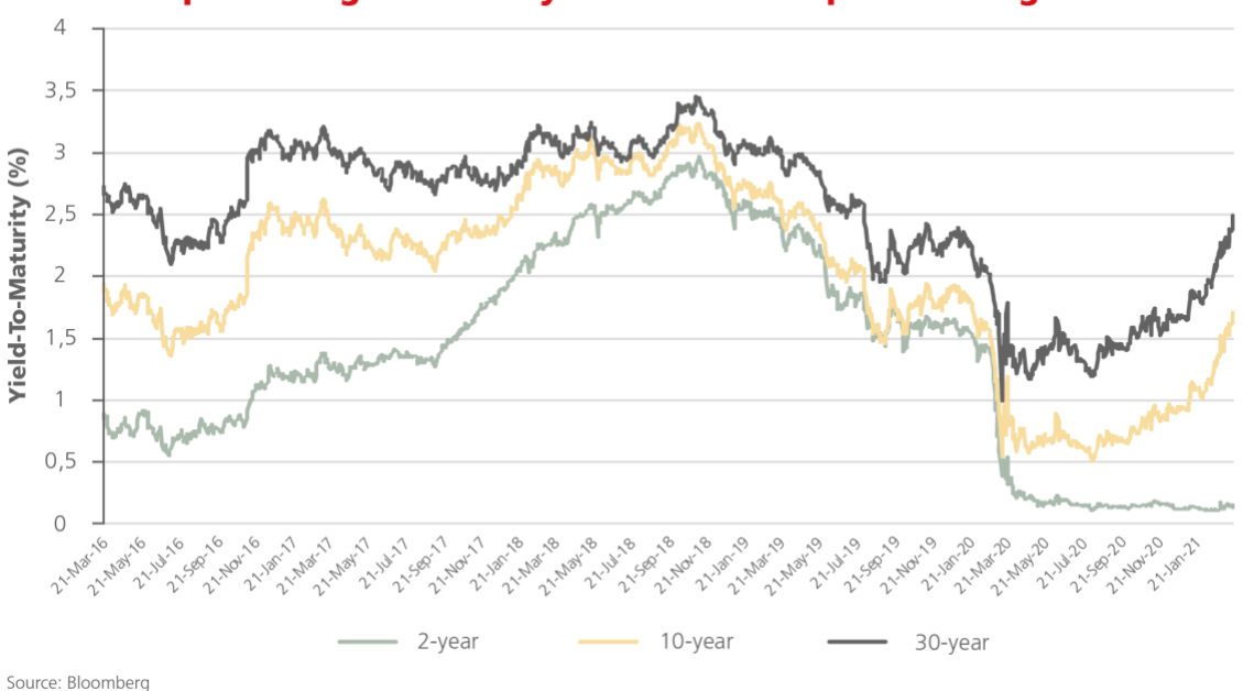
Graph 1: Long UST bond yields risen 100bps since August 2020

current levels to cause a shift in investor risk appetite and an EM sell-off.